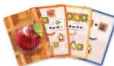
15 fruit pattern cards