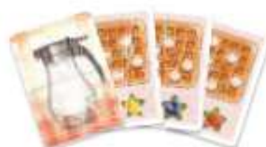
9 syrup dispenser cards