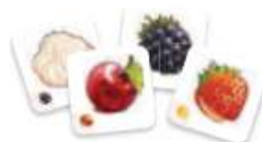
9 draft tiles