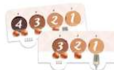
2 turn order tiles