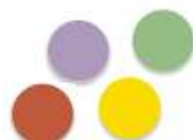
4 player pawns