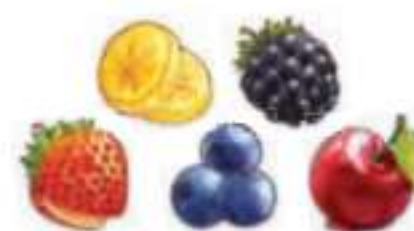
20 fruit tokens each in 5 shapes (cherry, strawberry, blackberry, banana, blueberry)