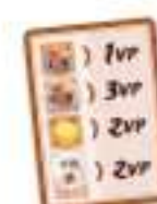
1 standard scoring card