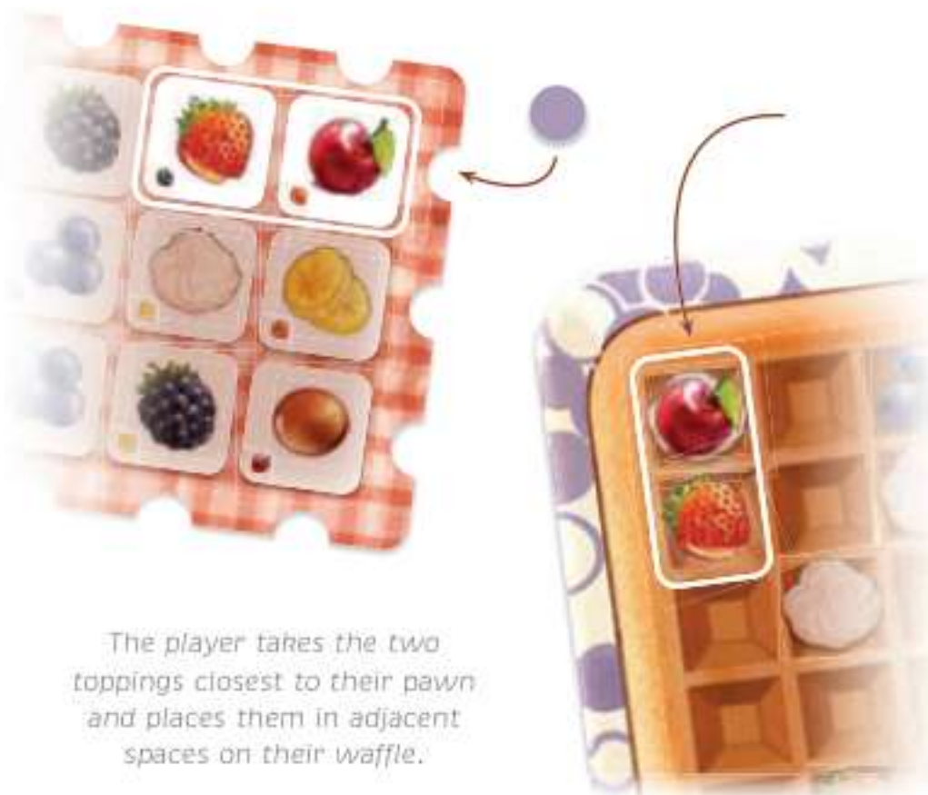
The player takes the two toppings closest to their pawn and places them in adjacent spaces on their waffle.

On a player's turn, they place their pawn in an open slot in the draft board and take toppings from the supply that match the 2 tiles closest to their pawn. Next, they place the toppings on their waffle boards on 2 adjacent spaces. After they check to see if they completed any fruit patterns or goals, it is the next player's turn. When everyone has taken a turn, the round ends and a new one begins.