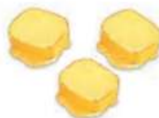
3 butter tokens