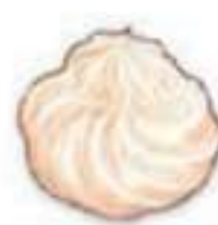
32 cream tokens