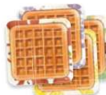
4 waffle boards