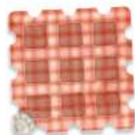
1 draft board