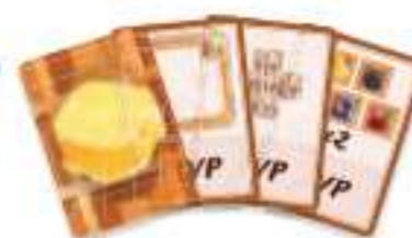
8 goal cards