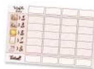
1 score pad