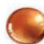
70 syrup beads