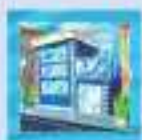
2 Shop Tiles*