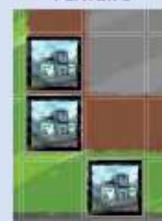
(Black with Wild Cubes added)