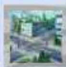
2 Road Tiles*