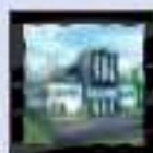
2 Factory Tiles*