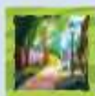
2 Park Tiles*