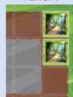
(Green with no Wild Cubes)