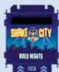
1 Cube Shaker

This is not a complete game. A copy of Shake That City is required to play Wild Nights .