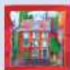
2 Home Tiles*