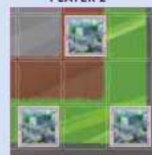
(Gray with Wild Cubes added)