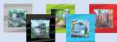
27 Mini Building Tiles*

*Add these extra building tiles to your existing Shake That City tiles. Actual components may vary.