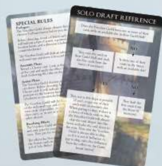
Solo Rules Draft Reference

Your game of Edge of Darkness should include the following for the purpose of the Single Player Rules. If it does not, contact customerservice@alderac.com for assistance.