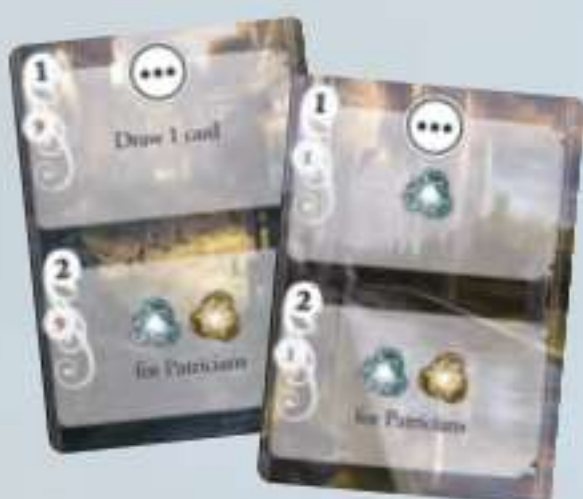
7 Action cards (double sided)