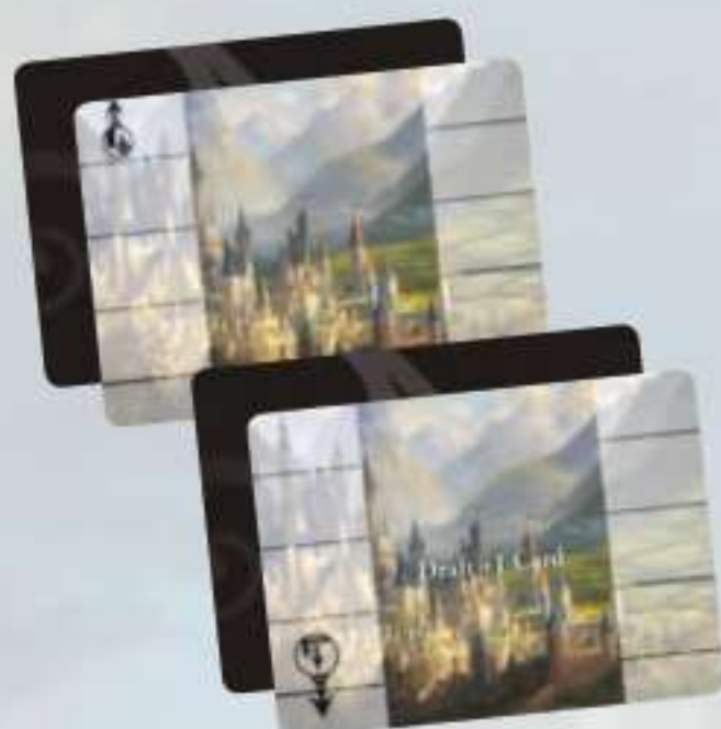
22 Choice cards (12 A and 10 B)