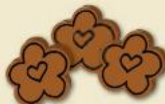
Wooden Treat Tokens