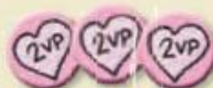
Victory Point Tokens