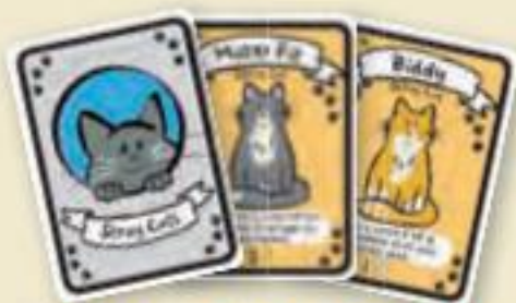
Stray Cat Cards