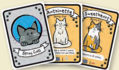
Stray Cat Cards