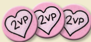
Victory Point Tokens (VP)